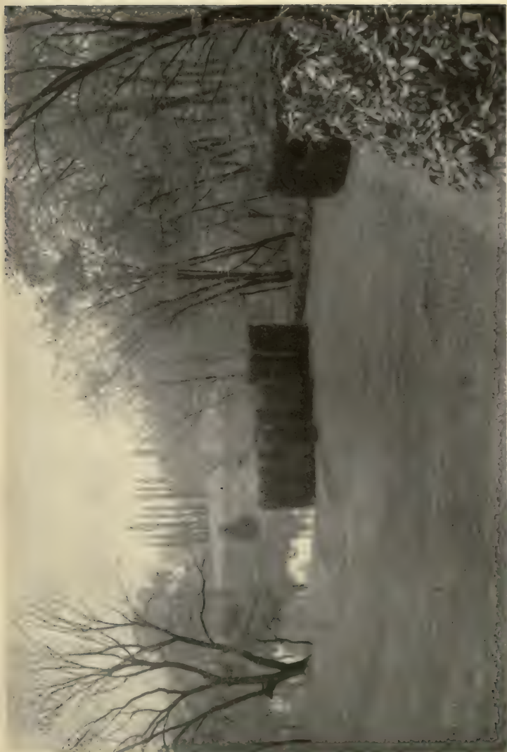
'THE DELL THEATRE. HILL SCHOOL, POTTSTOWN, PA.